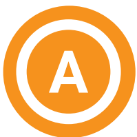
Image Rights: Miletic, Tania Piu, et al. Guidelines for working effectively with interpreters in mental health settings. Melbourne: Victorian Transcultural Psychiatry Unit, 2006. (Page 22)